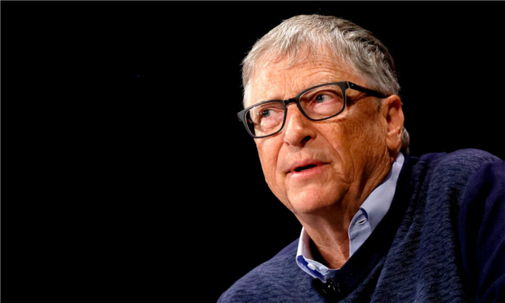
Bill Gates speaks onstage at the TIME100 Summit 2022 on June 7, 2022 in New York City.

Bill Gates ' book "How to Prevent the Next Pandemic" (published in 2022) was written with the firm conviction that future pandemics are the biggest threat to humankind and that survival depends on global pandemic preparedness strategies.